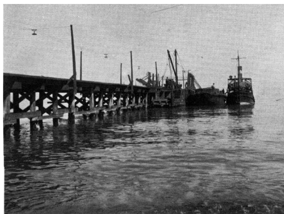
The Original Jerry at Pendaia, a barge and the Tug Foam Alongside

Fig. (2). Ports Operated by CMC. History of mining in lefke. www.gucsen.org/.../HISTORY-OF-MINING-IN-LEFKE.doc . 28. August.2017