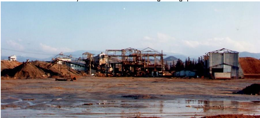
Fig [4]. The Current Idle Situation of CMC

Here it is important to mention that the demise of copper mining was not the result of lower prices or energy costs. Rather it was the result of the island's crisis. So we can assume that if the CMC Company would have continued with its actions after 1974 the island might be in a position to compete with important industrial zones worldwide today. But the dimension of destruction might have been worse than its abandoned condition if they would have continued working with high petrol or low mine costs.