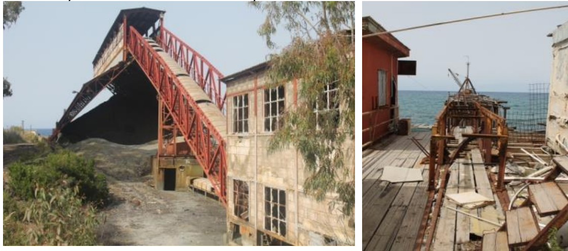
Fig. (3). The Unused Railway Transport of CMC of Today.

which were constructed for CMC used to carry people and cargo. The railway has shortened the long distances. The facilitation of the transportation on the island made it possible to travel to different cities. In this way, the railway has brought liveliness to all cities. (Fig. 3)