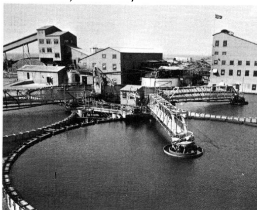
Thickening ponds at Xeros. Behind them are Units for Leaching, Grinding, and Floating

The first ores exported from Skouriotissa were shipped from Famagusta and Pendaia. Subsequently, ores from the Skouriotissa and Mavrovouni mines were taken to the jetty at Xeros by newly-built railroads, and then shipped overseas for concentration and smelting. (Fig. 2) The only processing of these early ores consisted of crushing to uniform size, which was handled by primary crushers at the mine sites (Wilson & Ingham, 1959). In this way expulsion of the copper mine was ensured the first time in Cyprus. In this direction, Lefke continued its rapid progress in the industrial field.