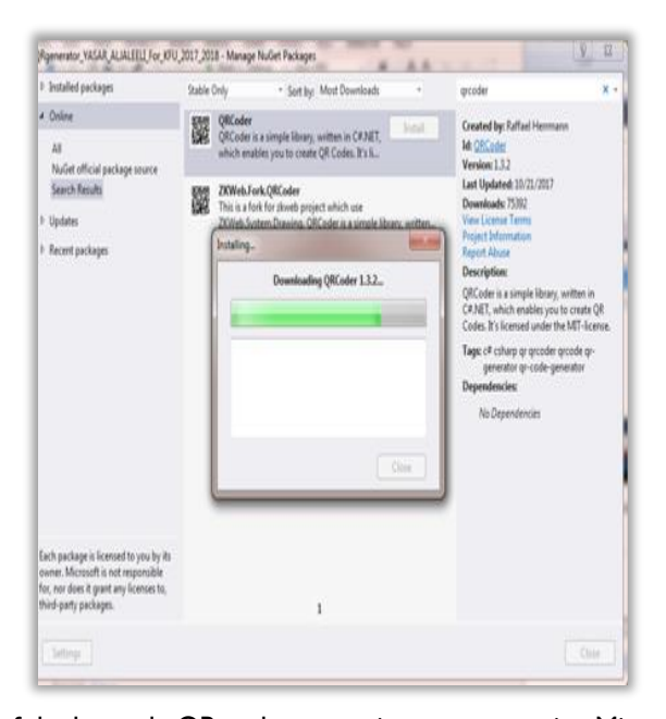
Fig. 1. The form of the barcode QR code generation program using Microsoft Visual Studio