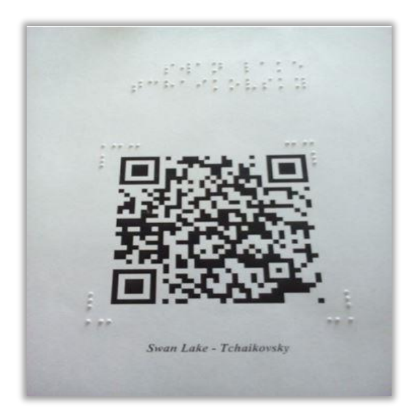
Fig. 4. Example I

books or children's stories on YouTube or other web sites. See the example in Figure 5: