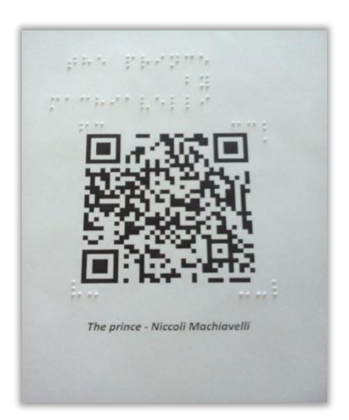
Fig.5. Example 2

In the second example, the researcher used the book title (Hicks and Sinkinson. (2011). The visually impaired can listen to this book for more than 3 hours. The researcher used Braille code in English for use in the U.S.A. to design the example paper that can be seen above (Machiavelli, 2002). It is necessary to train visually impaired people in a sufficient and effective manner to use both the barcode readers and the method of locating the QR code on the page, which is surrounded by Braille code to determine