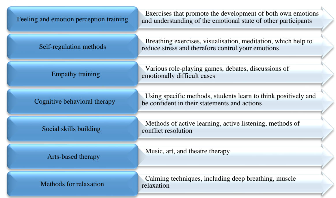
Figure 2 . Psychological methods that contribute to the development of socio-emotional skills

In particular, methods of training the senses are important. For example, the 'rose-coloured glasses' exercise, where students need to name only the good qualities of other applicants. Such exercises contribute to the development of both their own emotions and understanding of the emotional state of other students. At the same time, self-regulation techniques are important. They can include breathing exercises, visualisation, meditation, which help to reduce stress and therefore control emotions (Hasiuk et al., 2022).