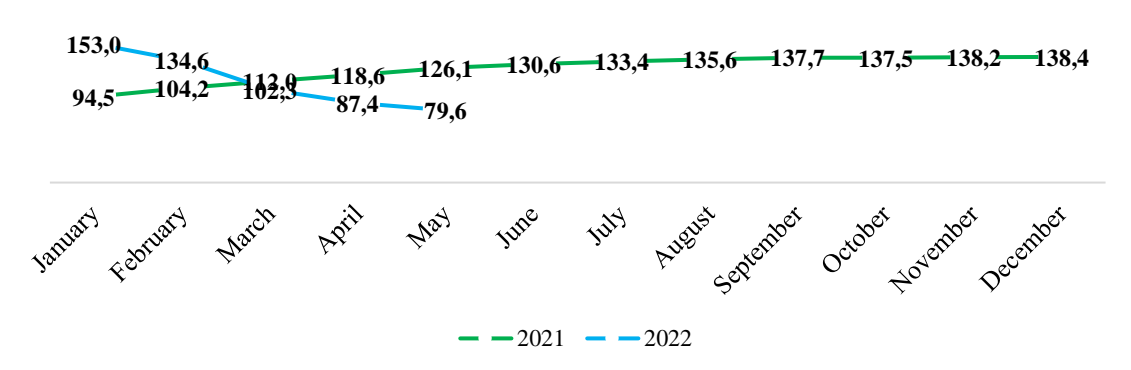
Figure 3. The rate of growth (decrease) in the export of goods as a percentage compared to the corresponding period of the previous year, cumulative total (compiled according to the data of the (State Statistics Service of Ukraine, n.d.).

amounts to -15%. Moreover, the IMF predicts a decline in Ukraine's GDP to 35% in 2022.