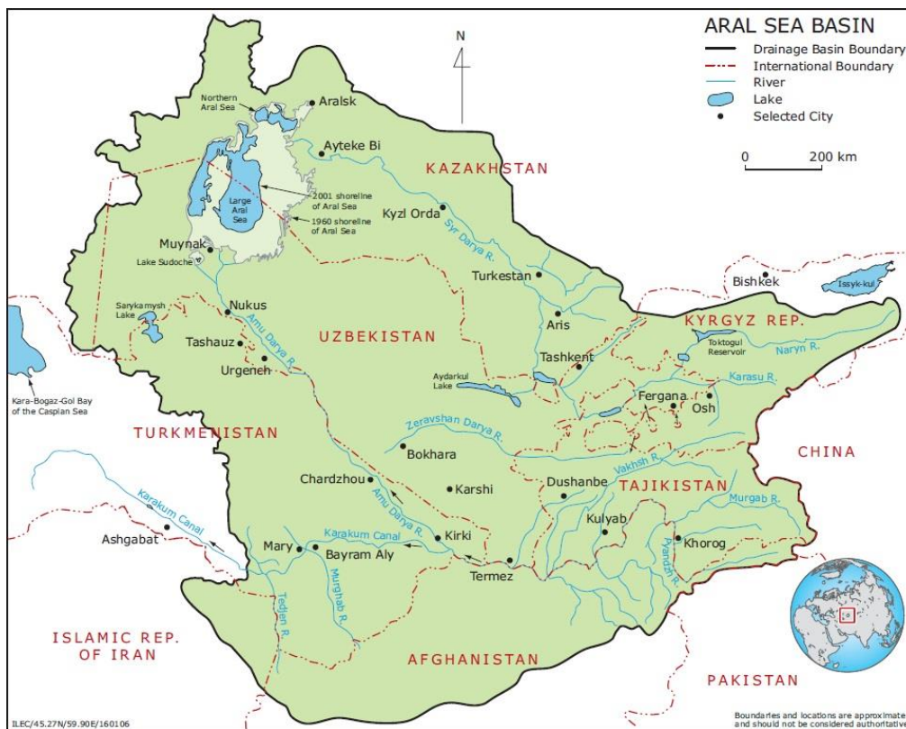
Figure 1. Geographic location of the Aral Sea basin (World Lake Database).

The collapse of the Soviet Union in 1991 caused problems in the Aral basin. The hardest problems that the region faced after independence was mainly a tight link between regional water management systems. These links ignored the new political boundaries (Klötzli, 1997).