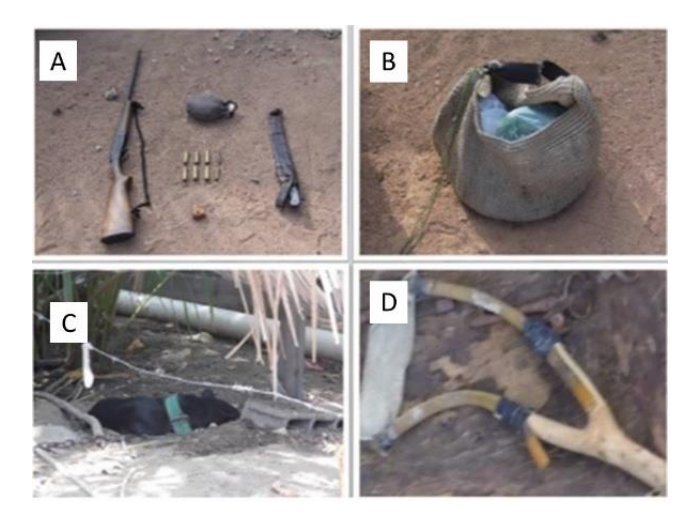
Figure 3. Hunting and capture instruments of wild animals. a) Shotgun, ammunition, machete and canteen used in hunting activity; b) Creel (Aió) used to store hunting instruments and captured birds; c) Hunting dog and d) Slingshot used to target wild birds.

shuttlecock/slingshot (Table 1). These techniques follow the pattern recorded in other studies (Alves et al., 2009; Barboza et al., 2016). The use of firearms associated with dogs, which are trained while still puppies for the slaughter of the targets, are used to catch tamandua, armadillo, skunk, oncilla, and the black and white tengu. The dogs are trained to sniff and follow the traces of these animals, which take refuge in burrows and are then captured by the hunter.