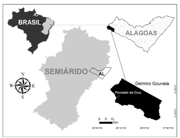
Figure 1. Municipality of Delmiro Gouveia, in the Semi-arid region of Northeastern Brazil, where the village of Cruz is located.