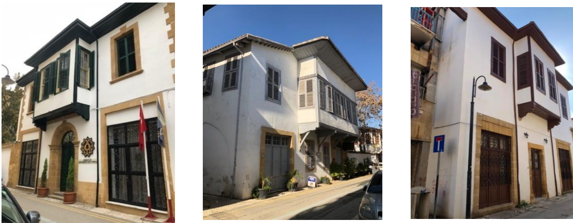
Figure 9. a, b, c. Examples of Traditional Turkish Houses in The Victoria Street (Author - 2020).

plan, were built with mud brick. These houses have arched doors, rectangular shaped windows with wooden blinds, and bay windows supported with timber corbels. Their roofs are sloping type, made of timber structure and covered with roof tiles. The houses with dates such as 1893, 1900, 1907, and 1920 on the iron lattice of their doors, with shops on their ground floors, also carry the characteristics of the Traditional Turkish Houses, and give a silhouette to the street with their bay windows and wide timber ceilings with eaves (Cogaloglu & Turkan, 2019), (Figure 9 a, b, c).