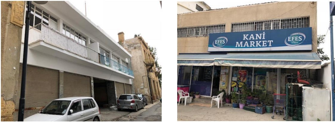
Figure 13. a, b. Frame Structure System Buildings in Victoria Street

As a result of political disagreements and armed conflicts which began at the end of the third year of the Republic of Cyprus, Nicosia was divided into two, Turkish and Greek sections, at the beginning of 1964; the south end of Victoria Street became a border line and was closed to traffic at that end. The Armenian population of the street, which contributed greatly to the street becoming an important active arterial road of Nicosia, left Victoria Street and settled in the Greek part of the city. Turkish Cypriots that were forced to leave their homes and take refuge in the Turkish part of Nicosia were settled in the houses and shops abandoned by the Armenians, resulting in a change of the demographic state of the street.