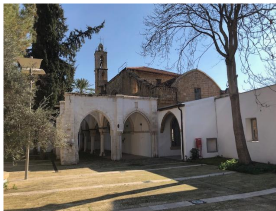
Figure 6. Armenian Church & Monastery

The church built in the same place as the present day Armenian Church, during the Byzantine period, in 1116, was turned into a Carthusian Nunnery a few years after the start of the Lusignan period, and was used by the nuns of the Benedictine sect coming to Cyprus about a hundred years later. This church was completely ruined by an earthquake in 1303 and the present day Gothic style church (Notre Dame de Tyre) was built in its place by King Henry II between 1308 and 1310 (Bağışkan, 2013). According to this source the first building of the historical texture of Victoria Street reaching the present day, the Armenian Church, was built during the Lusignan period (Altan, 2006), (Figure 5, 6).