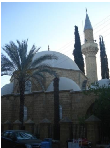
Figure 7. Arabahmet Pasha Mosque (Author - 2020)

Arabahmet Pasha Mosque in the north, and the church which was built in the south in the place of the present day Catholic Church, built during this period, established the beginning and end of the street texture.