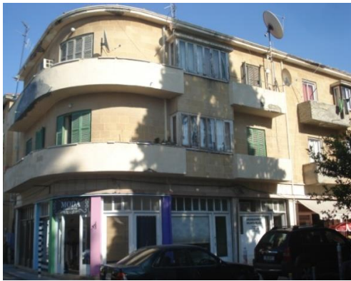
Figure 11. Hacı Münür Efendi Apartment (Author - 2020)

corner parcel in the south, where Victoria Street merges with Kamil Pasha Street in the east, was built in mid 1950s. Apartment buildings gave a new character to the historical texture of Victoria Street, being different from traditional architecture (Figure 11, 12). The Holy Cross Catholic Church in the east of the south end of Victoria Street, at present being beyond the border, in the Greek part of Nicosia, was built during 1900-1902, in place of a church that existed during the Ottoman period. In 1959, a monastery building was added next to the church (Bağışkan, 2018).