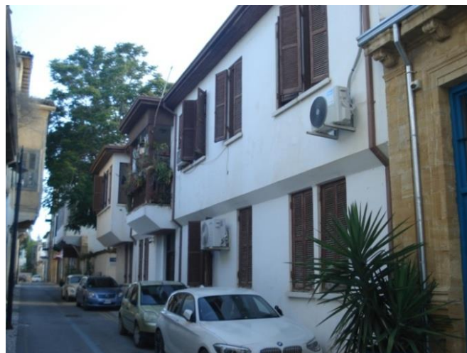
Figure 14. Two Floor Housing Constructions in Victoria Street (Author - 2020)

There had been no change or development in the historical texture of Victoria Street until the 1980s, and wear and damage was seen in the texture due to neglect because of the economical inadequacy of the people residing there. During the first years of the Turkish Republic of Northern Cyprus, founded in north Cyprus in 1983, two floor housing constructions were built on the north corner parcel where Derviş Pasha Street stretching westward vertically and forms a conjunction with Victoria street, addressed at both streets. The facades of these houses, one facing Derviş Pasha Street and one facing Victoria Street, are designed in harmony with the traditional houses in the street, with their bay windows, oblong shaped windows with timber blinds, and white washed (Figure 14).