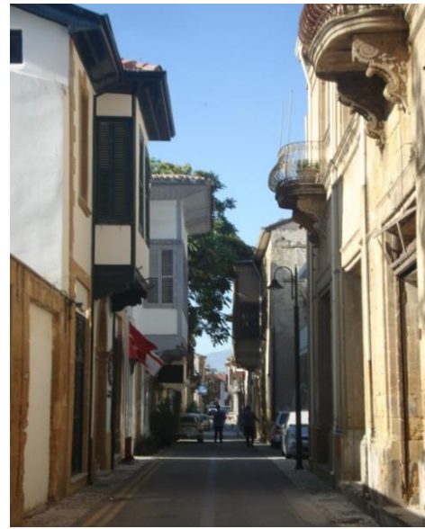
Figure 4. Victoria (Şht. Salahi Şevket) Street (Map Office of (Author - 2020)