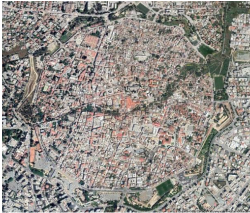
Figure 1. Nicosia Walled City Satellite Image

Armenians emigrating from Anatolia in 1920, and settling in this neighborhood, resulted in an increase of Armenian population, thus turning it into an Armenian neighborhood (Turkan & Köksaldı, 2019). With the inter-communal conflicts, which began at the end of 1963, the Armenians in the neighborhood moved the Greek part in the south of Nicosia (Dağlı, 1999). According to the Master Plan made in 1981, which encompasses the whole of Nicosia, Arabahmet Neighborhood has become a special protection area, and restoration works began with financing from the United Nations. In spite of demographic changes in time and insufficient protection, Arabahmet Neighborhood still continues to exist as an important part of the historical city texture of Nicosia with its XIX. century Traditional Turkish Houses lined side by side in its streets (Turkan, 2010), (Figure 2).