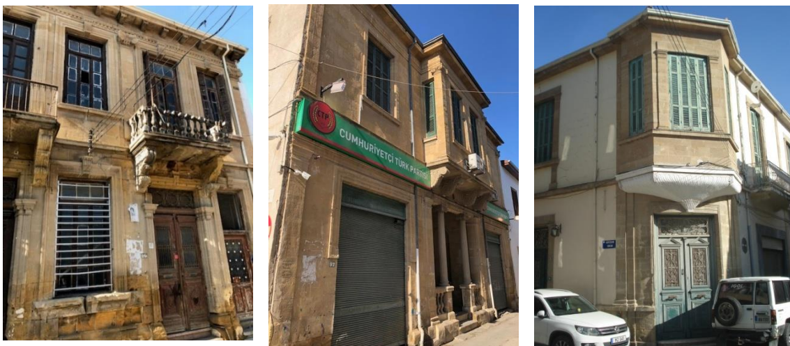
Figure 10. a, b, c. Two Stories Houses Made by Stone in Victoria Street (Author-2020).

different architectural style to the historical street texture with their design of façade, bay windows made of stone, or balconies with iron railings (Figure 10 a, b, c).