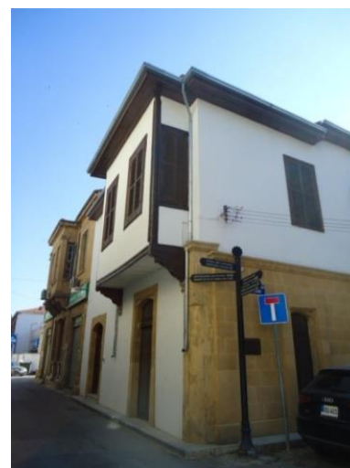
Figure 8. Example of Traditional Turkish House (Author - 2020)