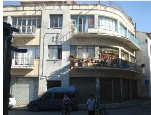
Figure 12. Orhan Şevket Apartment (Author - 2020)

The British period provided a great contribution to the formation and development of the historical texture of Victoria Street with contemporary housing structures of mostly two floors, and the shops on the ground floors of these buildings made it an important arterial street of walled city of Nicosia with their active commercial functions. Moreover, the Holy Cross Catholic Church of the present day historical texture of the street being built during this period, formed the south border of the street just like Arabahmet Pasha Mosque marks the end of it in the north.