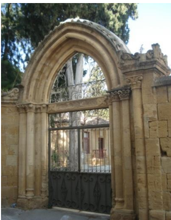
Figure 5. Gate of Armenian Church & Monastery

Although there are no works in the historical texture of the walled city of Nicosia from this period, according to some sources (Bağışkan, 2013) there was a religious building in the place of the Armenian Church (Notre Dame de Tyre) in Victoria Street, from the VIII. Century. During this period a church was built in the spot where the present day Armenian Church is in 1116, by the King of Jerusalem, Baldwin de Buillon (Bağışkan, 2013). Therefore, it can be seen that the first formation of the historical texture of Victoria Street began over a thousand years ago, with a church built here during the Byzantine Period of Cyprus.