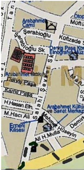
Figure 3. Victoria (Şht. Salahi Şevket) Street Plan TRNC - 2014)