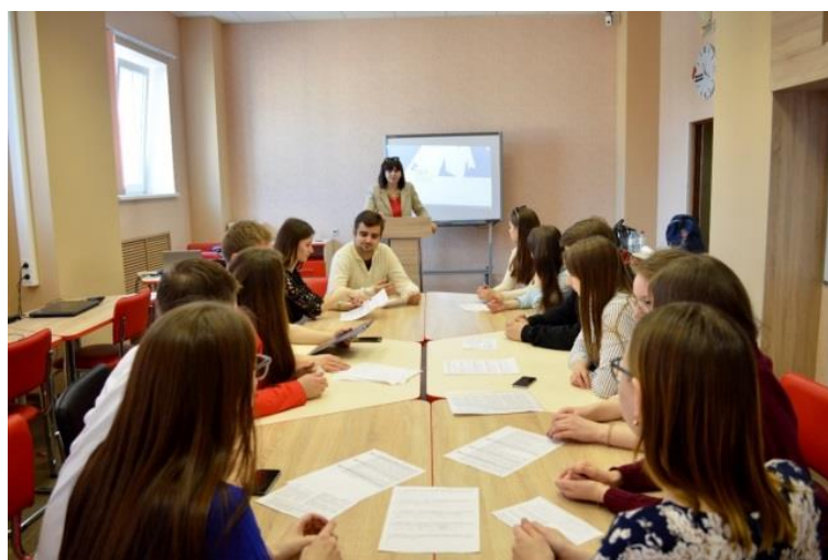
Fig. 1. Implementation of discussion technologies in the study of the course "Project activity of the teacher of vocational training»

Figure 1 shows the work of students during one of the discussions.